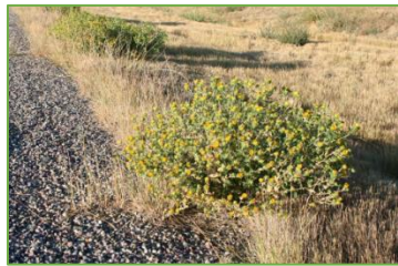
Curlycup Gumweed.

When is a weed not a weed? This question was explored during a recent NRCS Plant Materials Center (PMC) presentation regarding the natural succession of rangelands for restoration.