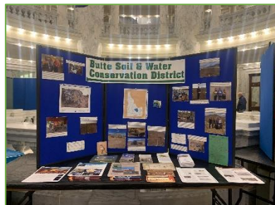
District's display board at Display Day in Boise.

The District took part in the District Display Day at the Capitol in Boise in January. The