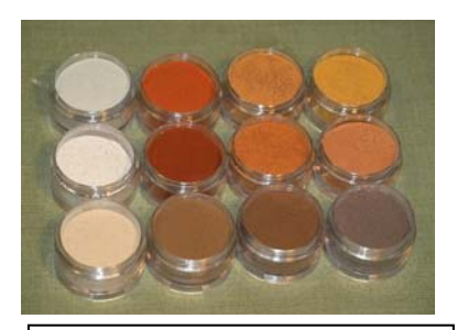
Soils from Oklahoma