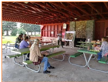
Public Meeting for Antelope Migration Corridor Initiative

A series of local working group meetings held in the Spring resulted in a team effort to retrofit fences to be more wildlife friendly along the pronghorn migration corridor in Butte and Blaine Counties. Interested landowners are