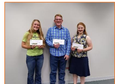
2021 Speech Contest Winners