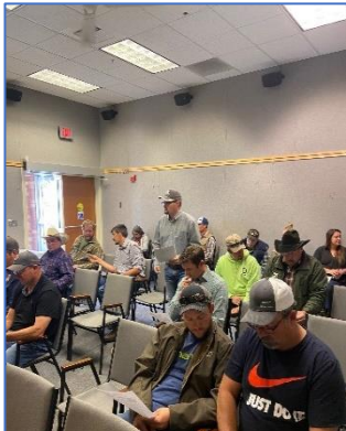
Local working group public meeting

The NRCS obtained 45 new contracts , benefiting 15,811 acres and provided $1.9 million financial assistance for landowners. Contracts were obtained in the general EQIP, general CSP, and Regional Conservation Partnership Program-EQIP programs.