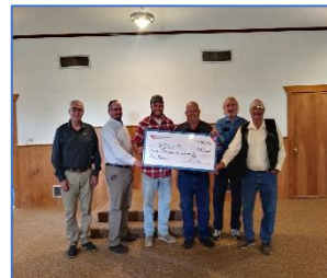
District Board receiving grant award