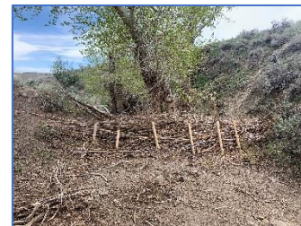
NRCS Beaver Dam Analog Installation