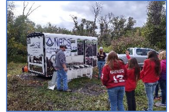
6 th Grade Natural Resources Tour