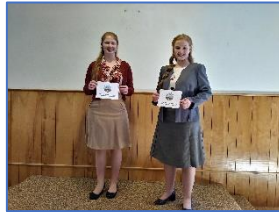
Speech Contest Winners