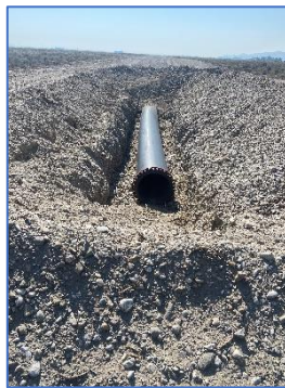
NRCS funded irrigation ditch to pipeline conversion project