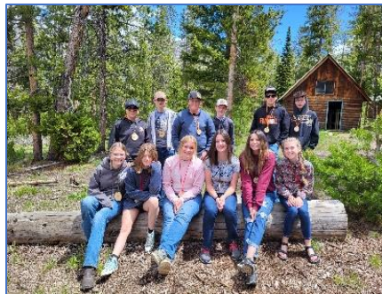
Natural Resource Camp campers