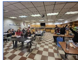
Forest Education Grant Activity