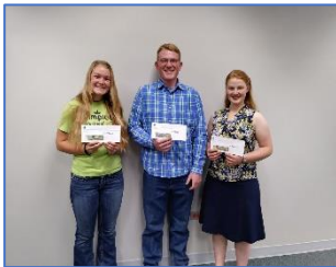
Speech contest winners