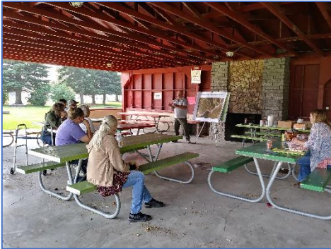
Public Meeting for Antelope Migration Corridor Fence Retrofit Project

The NRCS obtained 39 new contracts, benefiting 33,878.6 acres and provided $4.25 million financial assistance for landowners. Contracts were obtained in the general EQIP, general CSP, and Regional Conservation Partnership Program-EQIP