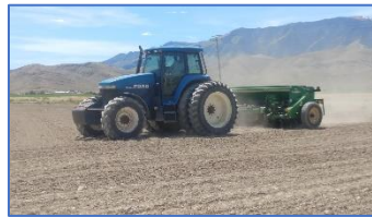
No-till drill in use