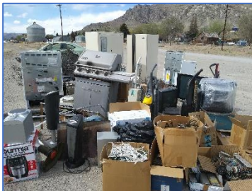
Electronic waste recycling day