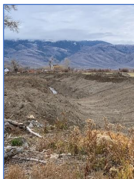
NRCS funded irrigation ditch lining project in-progress