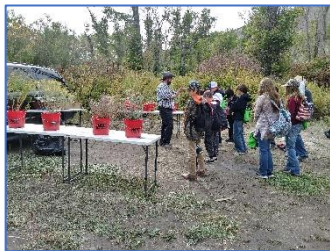
2021 6 th grade tour

The District produced an online newsletter to provide quarterly updates of District activities