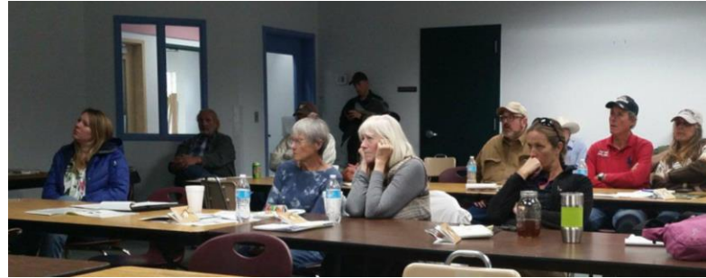
Presented by Butte SWCD October 4 th 2017